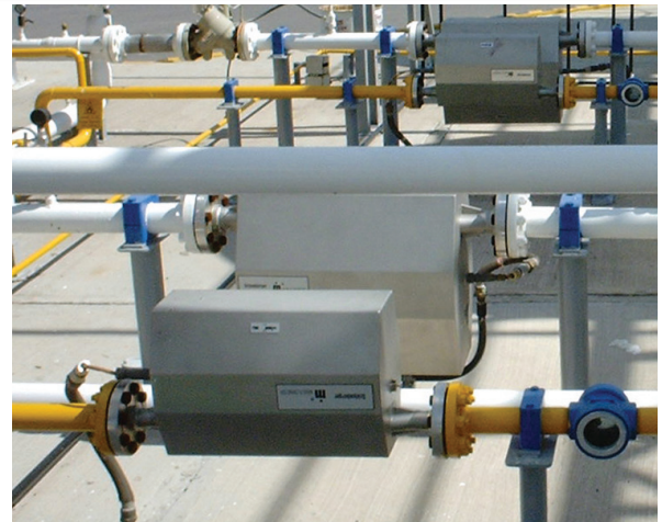
Neptune M-dot Coriolis mass flowmeters measure every fluid and vapor flow.