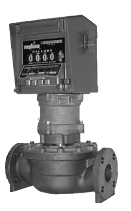
2" Type MP with Model 300 Calibrator and 800 Series Register

The unique design utilizes positive gearing throughout to eliminate slippage inherent in friction drive devices. The external calibrator's variable ratio drive unit mechanism is identical to the mechanism used in the Automatic Temperature Compensator, a dependable product which has been the standard of the industry for more than 30 years.